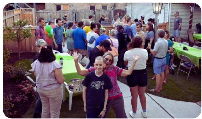
The Joy of Being Back in Person