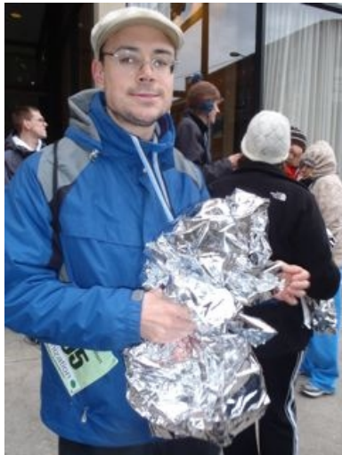
Marathon participants received metallic blankets to ward off unseasonably chilly Mobile temperatures