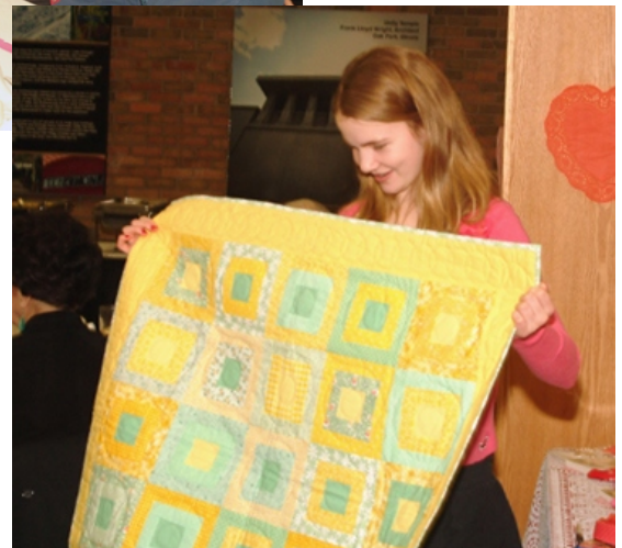
Raffle winner rushes to claim coveted quilt, handmade by St. Mary's quilters.